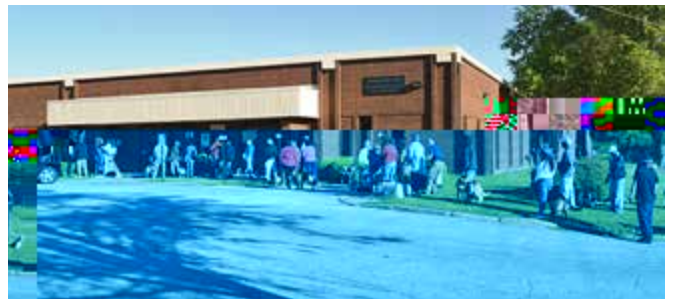
Small Animal Health Fair 2016 Highlights ...