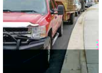
Horse Health Fair 2016 Highlights ...